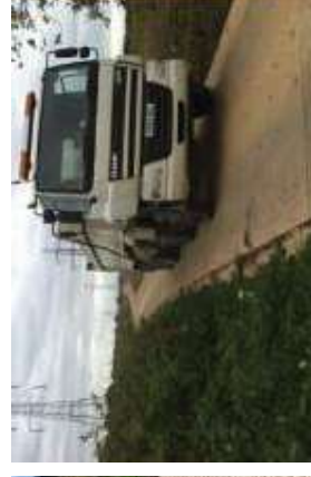
Haul road interlocking mats.